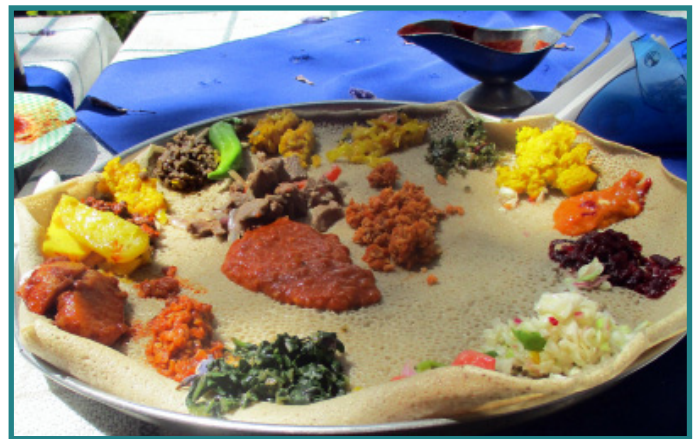
Injera and its accompaniments - traditional food of Ethiopia