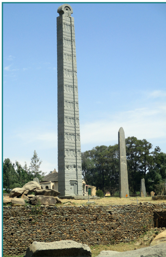
Obelisk of Axum