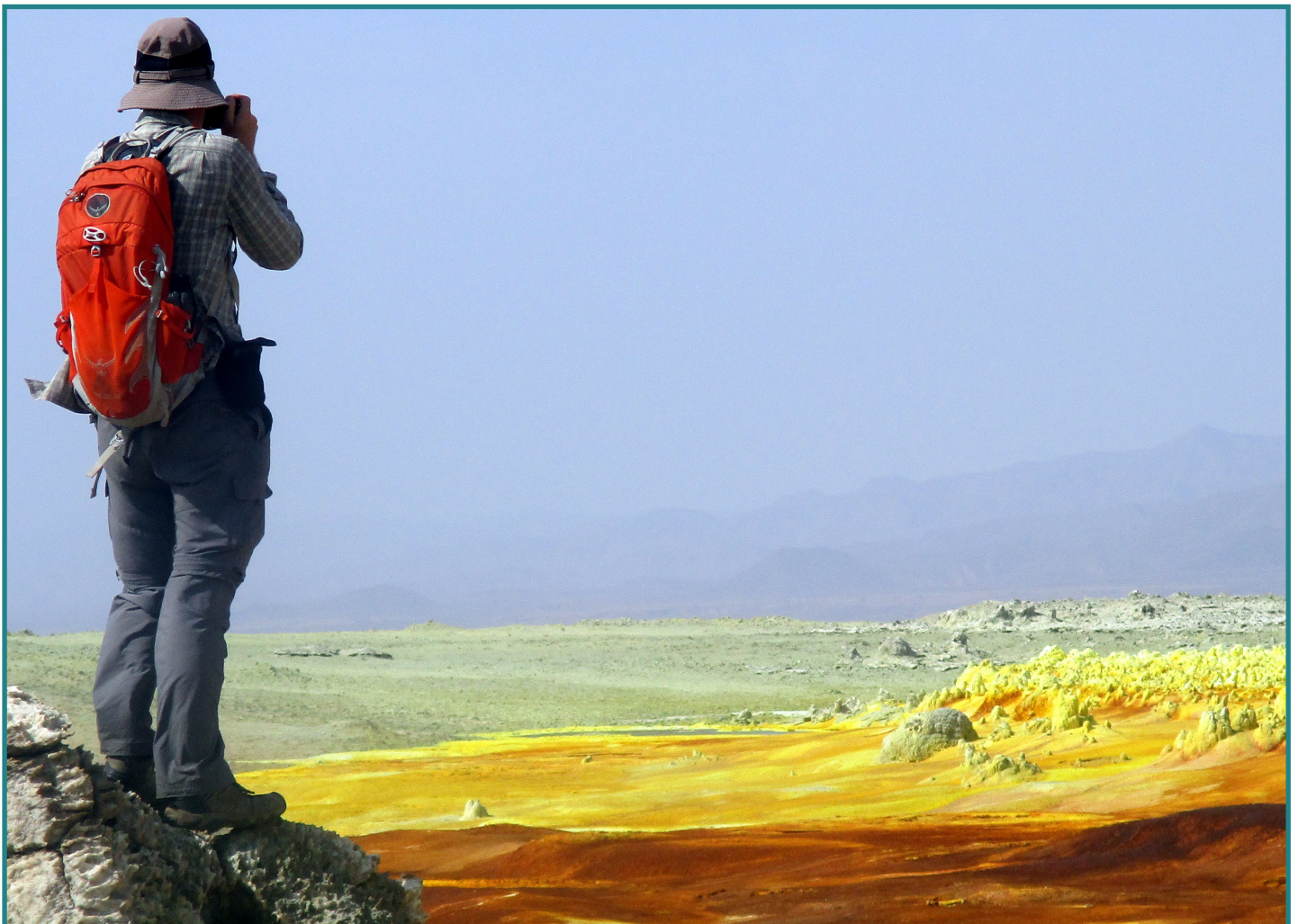
Denakil Depression Sulphur Pits - the most active place on the earth's surface