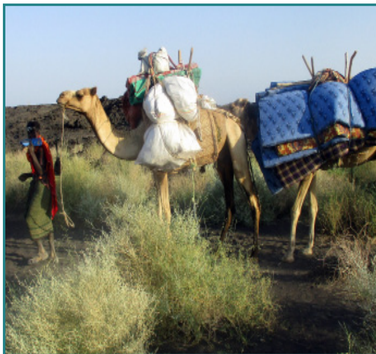
Camel trains take our gear to Erta Ala camp