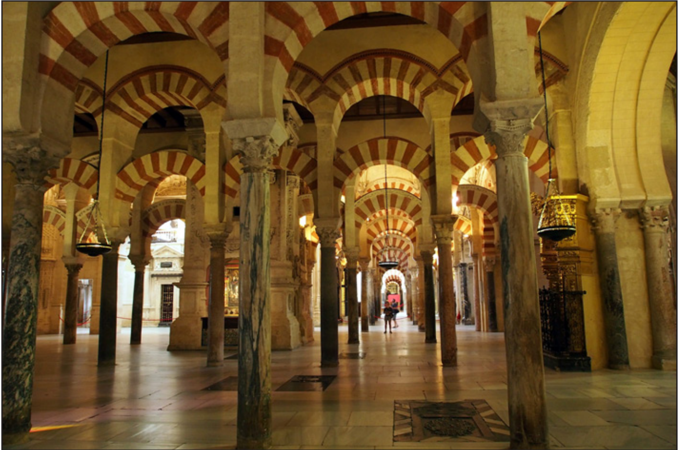
Cordoba's Mosque / Cathedral

Afternoon transfer to Capileira, a beautiful area on the south side of the Sierra Nevada. This was the last area lived in by the Moors after the reconquest (they were here until the 1580s.) This lovely village with a quaint hotel and makes a perfect walking base. At 1432 m it is the second highest village in Spain.