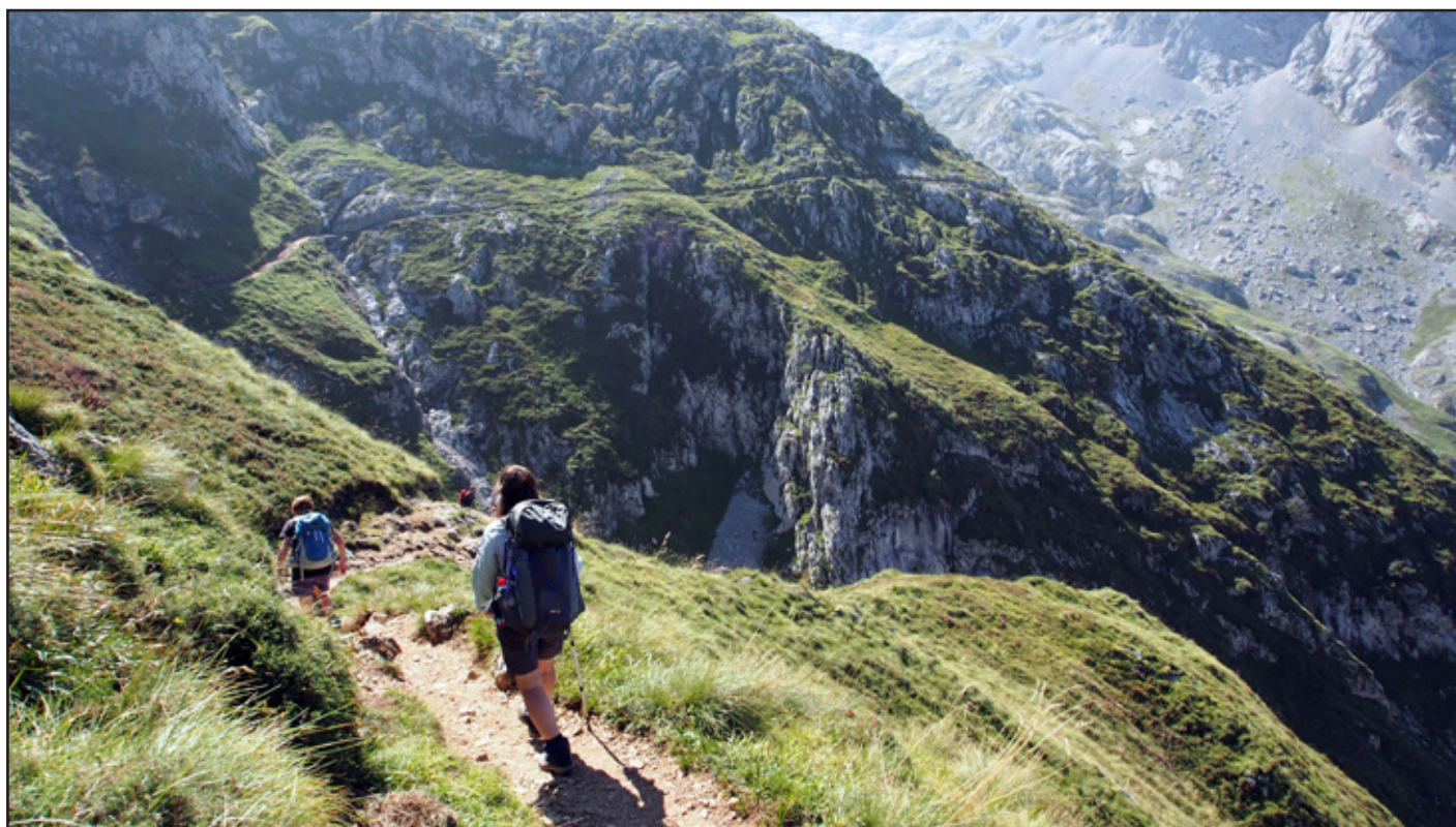
On the way to Naranjo de Bulnes

Return to Arenas via the hamlet of Bulnés. 4 hours.