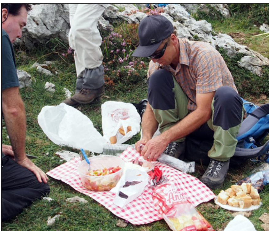
Lunch on the track

We will provide a detailed gear list. During the Chemin de la Libertee and the Pyrenean High Route treks, you will be able to leave excess clothing / luggage and collect it at the end of the treks.