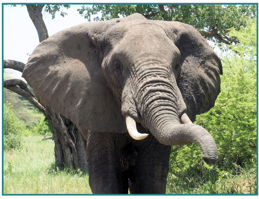
Africa - why wait??? Memories forever...

Take A Walk Publications and Adventures Pty Ltd PO Box 66, Camp Hill, Qld 4152 Australia 07 3843 3930 0417 611 810 info@takeawalk.com.au www.takeawalk.com.au