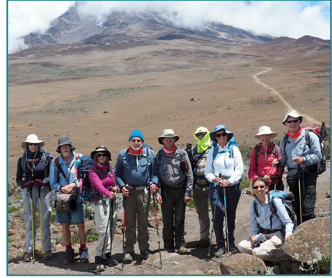
They're on their way to Kili...

m), bunk beds, running water and flush toilets